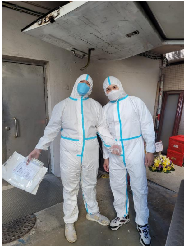
Fig. (1). Protection suit of funeral workers during covid-19 pandemic.

mortuaries. For example, the author handled a case involving a body that was in mortuary storage for 180 days. In this case, the family members were very sad and anxious about the condition of the body of their loved one. Fig. (2) shows a simple funeral being held outside a public mortuary.