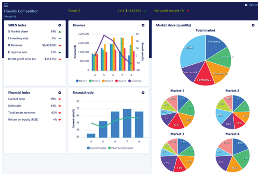
Fig. (1). Management dashboard.

Once you log in to the system, the management dashboard will be displayed with key performance indicators (KPIs) and related information (Fig. 1).