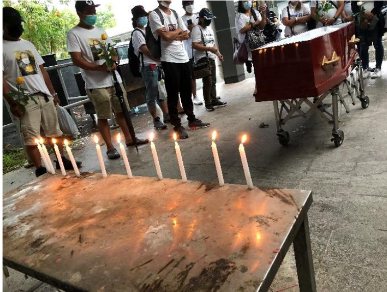
Fig. (2). Simple funeral held outside public mortuary.

than 1,500 cases; thus, the author has valuable experience in the field. The problem particularly affects Muslims, because according to Islam, the burial of remains should be within 3 to 4 days after death. During the COVID-19 pandemic, in many cities under lockdown, waiting for flight schedules for more than one month was common. Such a situation is unacceptable and disrespectful to grieving families.